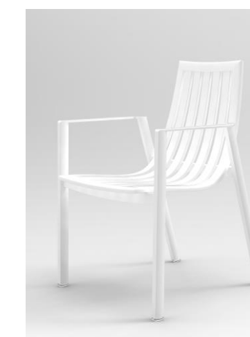
Matte White SRT01-W