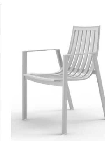
Silver Grey SRT01-S