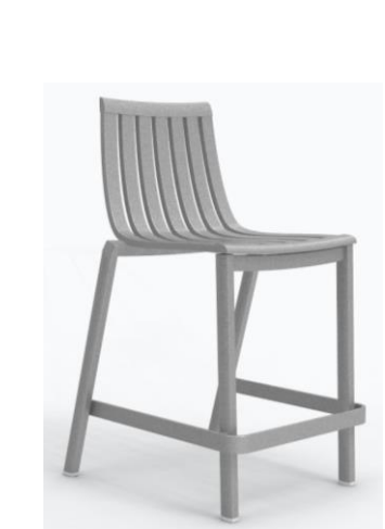
Counter Stool SRT04