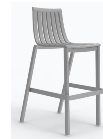
Bar Stool SRT03