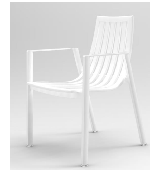
Matte White SRT01-W