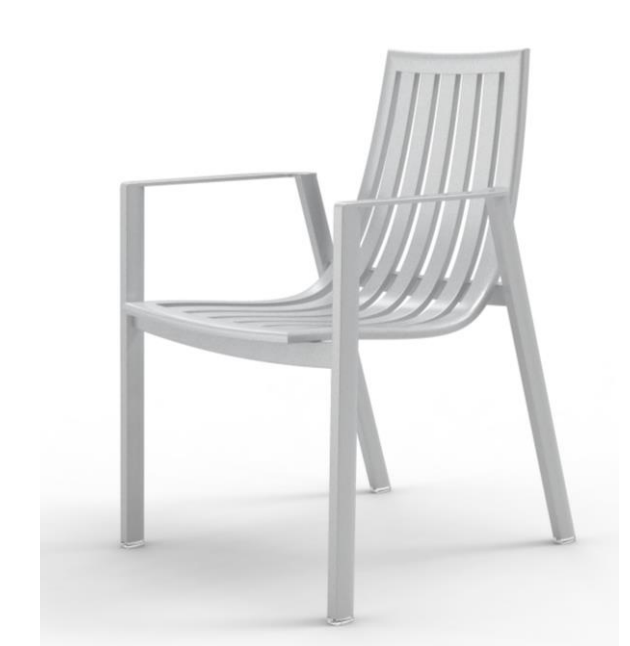
Silver Grey SRT01-S